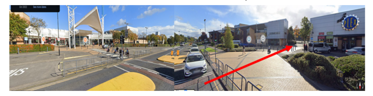
This is the front gate of Coolmine Lodge:

Access to the pedestrian walkway is directly opposite the front door of the shopping centre, next to Leisure Plex. See photo: